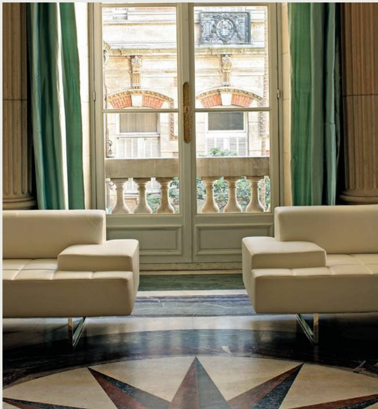
URBAN LEGENDS Clockwise from left: The magnificent Palacio Duhau Park Hyatt in Buenos Aires; the best Italian restaurant in Bangkok, La Scala at The Sukhothai; the famous Copacabana Beach as seen from the Sofitel in Rio de Janeiro.

Top table: In Bondi Beach at Sean's Panaroma ( seanspanaroma.com.au ), you