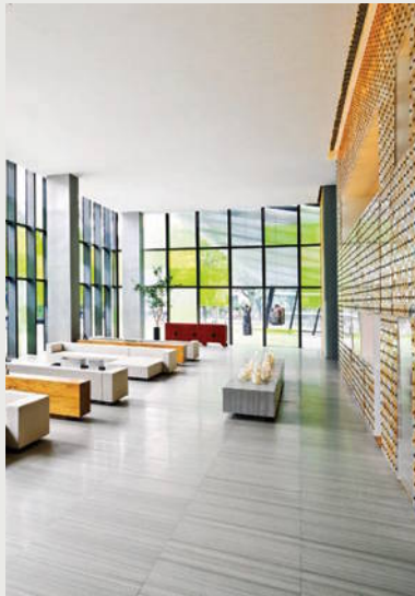
TOURISTS DE FORCE! Clockwise from top: The lobby living room at The Opposite House in Beijing; shopping in downtown Athens; Wine Gallery restaurant at the Life Gallery Athens hotel.

The signature suites at most Rocco Forte hotels ( roccofortecollection.com ) come with complimentary mobile phones pre-programmed with speed-dial for all the hot restaurants, bars, shops and taxi services!